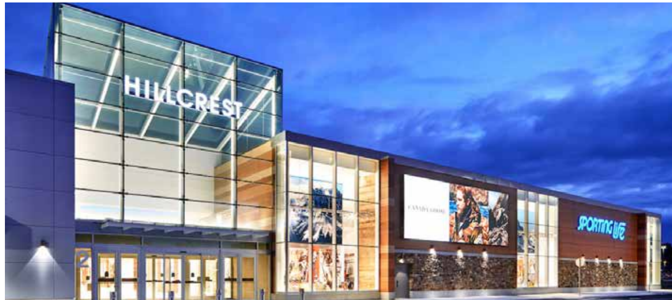
10 MINS AWAY