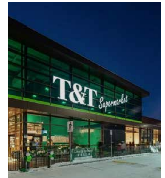
9 MINS AWAY