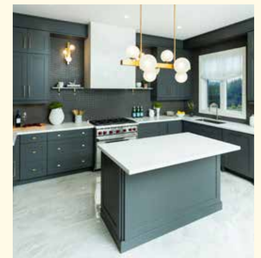
Adena Views - Aurora

Building Award Winning Communities Across The GTA