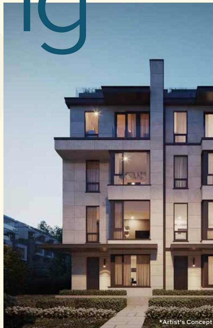
Charbonnel Townhomes - Toronto