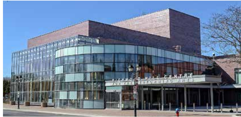
8 MINS AWAY