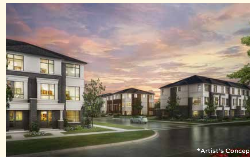
Canyon Hill - Richmond Hill

Treasure Hill's reputation with HCRA and TARION is second to none. They are also a member in fine standing with BILD (Building Industry and Land Development Association), formerly the Greater Toronto Home Builders' Association.