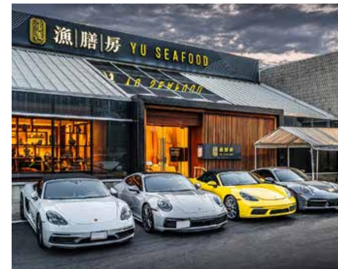
7 MINS AWAY