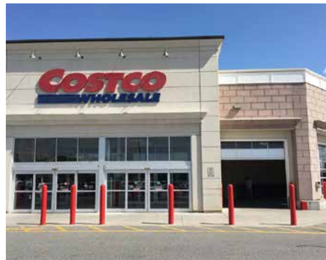
6 MINS AWAY