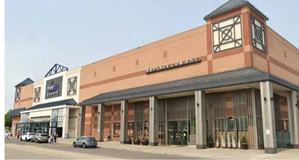
6 MINS AWAY