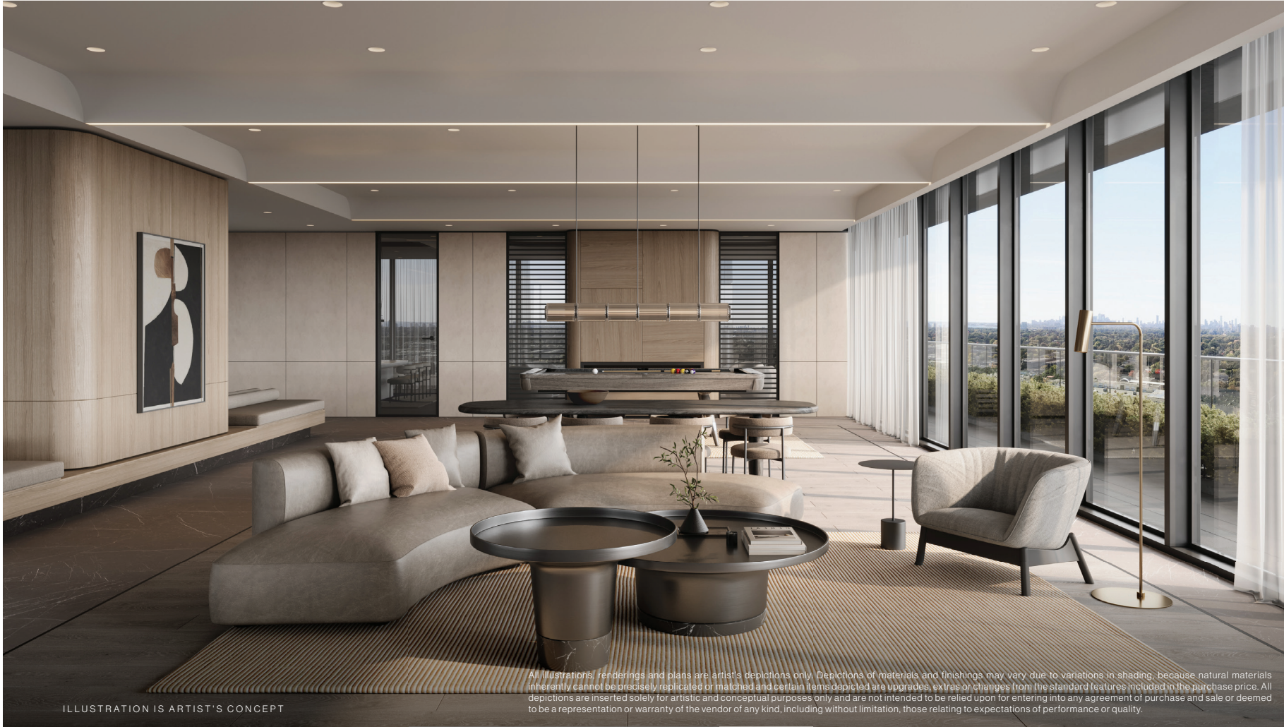
ILLUSTRATION IS ARTIST'S CONCEPT

It takes a village to build a community. Starting with a transformational vision, it continues with a transit-oriented and walkable design. It's easy to GO transit—subways and streetcars and it's just a short walk to an expansive public promenade. This is true urban living in the heart of the city. Along Kipling Corridor, where you can shop, dine, be entertained and more. It's easy to get to parks and trails for tranquility or activity. Hop on to the TTC and you're in the heart of the city.