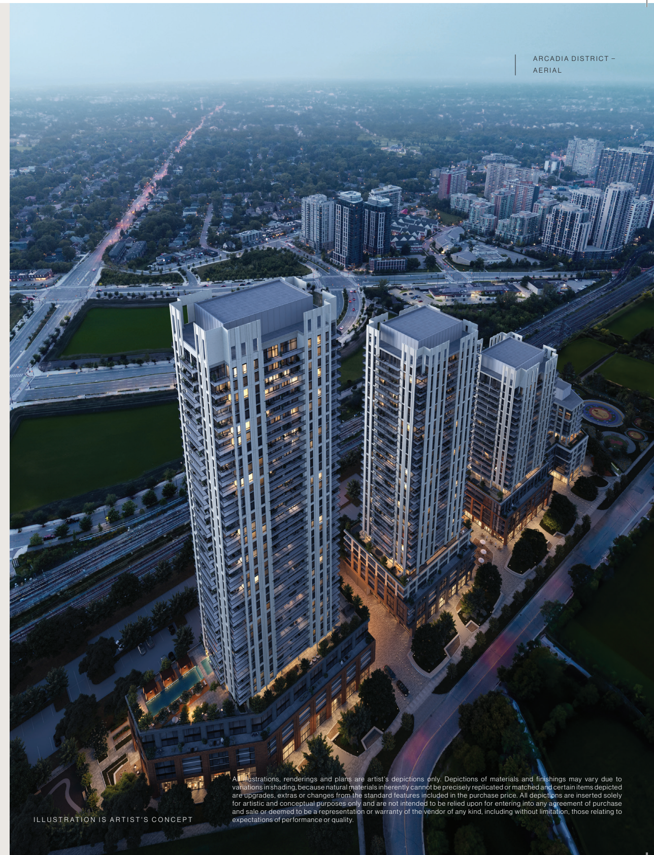
ILLUSTRATION IS ARTIST'S CONCEPT

All illustrations, renderings and plans are artist's depictions only. Depictions of materials and finishings may vary due to variations in shading, because natural materials inherently cannot be precisely replicated or matched and certain items depicted are upgrades, extras or changes from the standard features included in the purchase price. All depictions are inserted solely for artistic and conceptual purposes only and are not intended to be relied upon for entering into any agreement of purchase and sale or deemed to be a representation or warranty of the vendor of any kind, including without limitation, those relating to expectations of performance or quality.