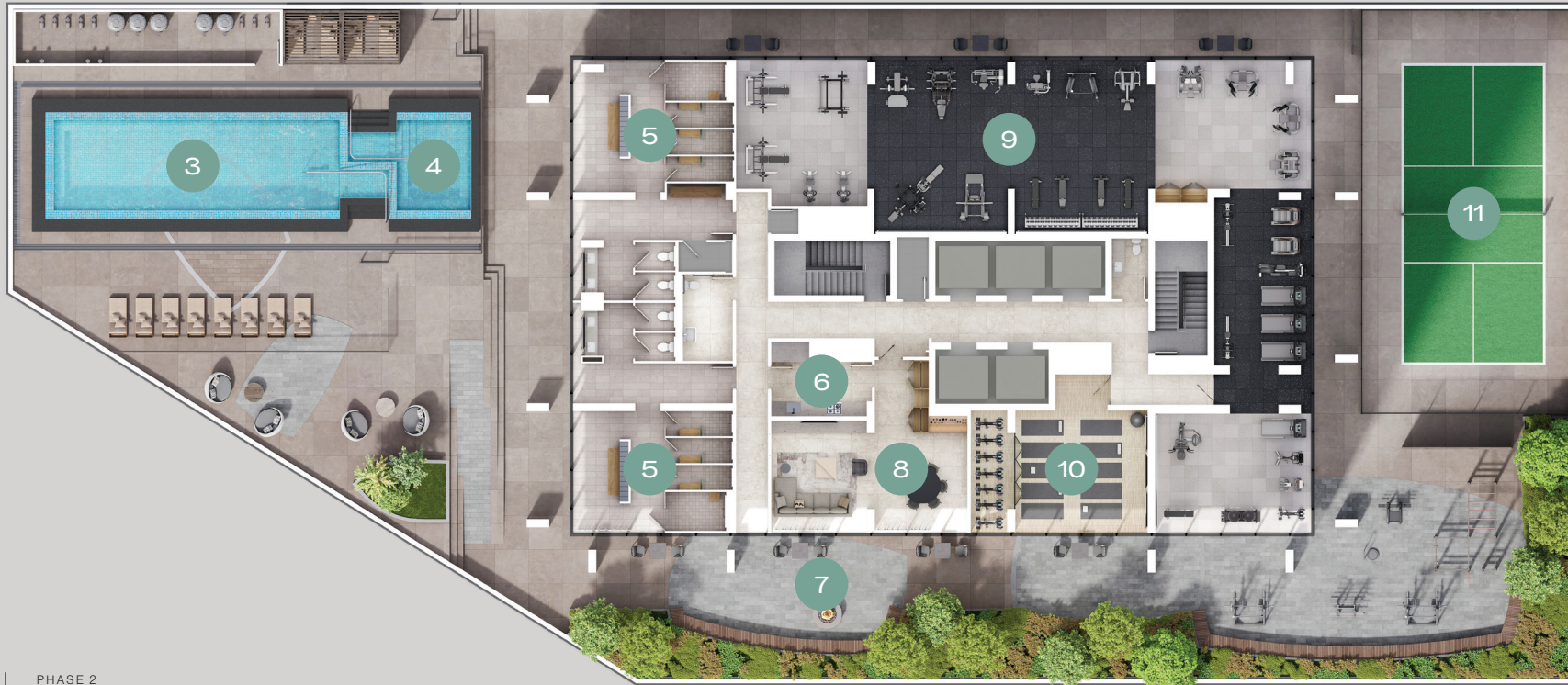
PHASE 2 AMENITY FLOOR PLAN - 1 ST FLOOR