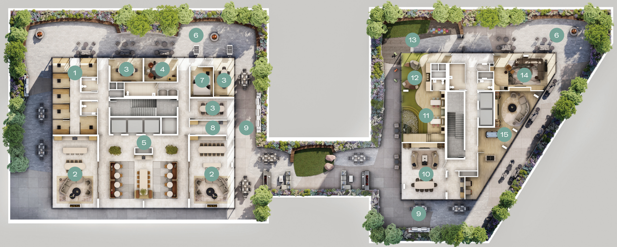
ILLUSTRATION IS ARTIST'S CONCEPT

All illustrations, renderings and plans are artist's depictions only. Depictions of materials and finishings may vary due to variations in shading, because natural materials inherently cannot be precisely replicated or matched and certain items depicted are upgrades, extras or changes from the standard features included in the purchase price. All depictions are inserted solely for artistic and conceptual purposes only and are not intended to be relied upon for entering into any agreement of purchase and sale or deemed to be a representation or warranty of the vendor of any kind, including without limitation, those relating to expectations of performance or quality.